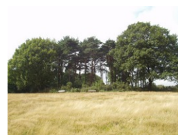
Boudicca's Mound, Hampstead.