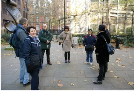
London Healing Day in November (see page 4 for report).