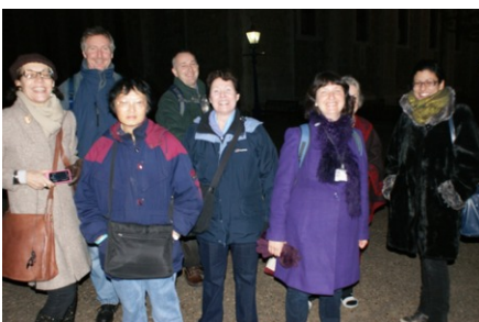
At the end of the day